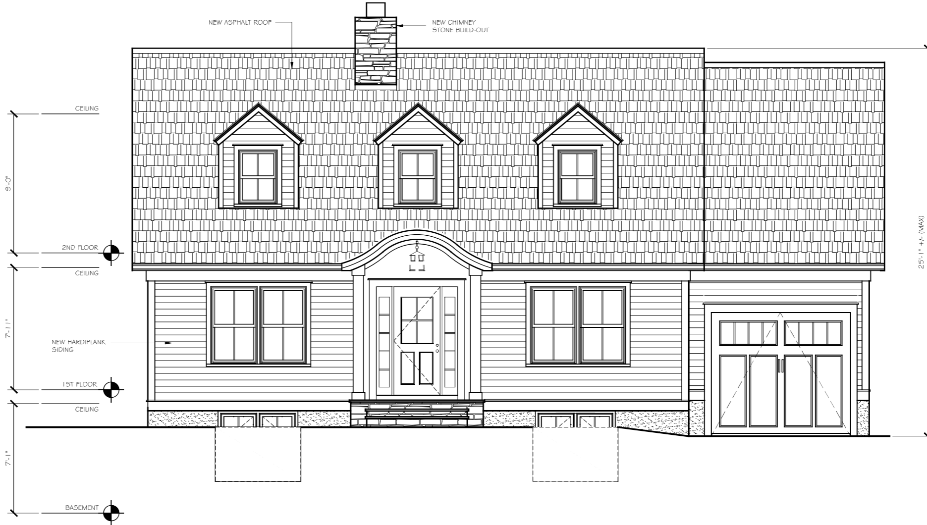
2 PROPOSED FRONT ELEVATION A5 SCALE: 1/4" = 1'-0"