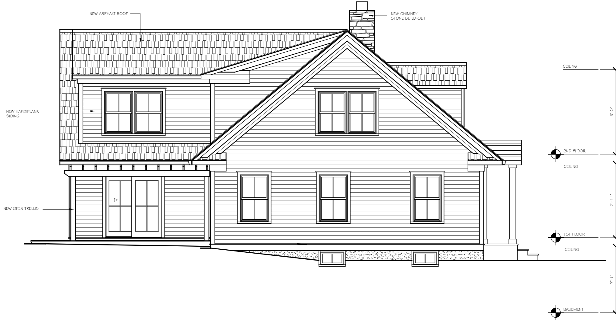
2 A8 PROPOSED LEFT ELEVATION SCALE: 1/4" = 1'-0"